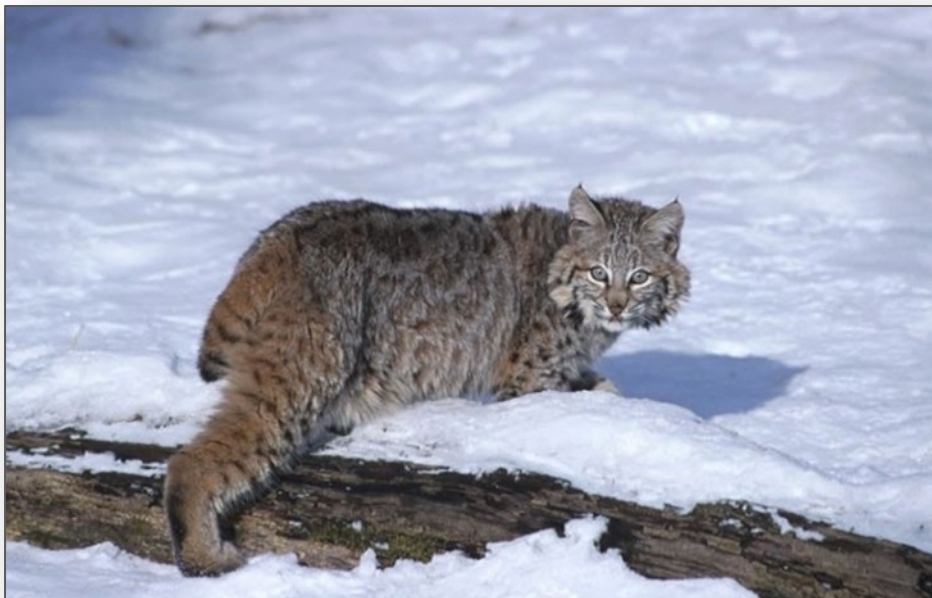
Bobcats are elusive inhabitants of Vermont's woodlands.

Fish There are no fishable waters on the WMA.