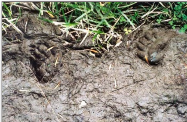
Bear tracks in mud and snow.

The WMA was acquired by the State of Vermont in 1990 as a result of Act 250 mitigation proceedings that compensated for deer wintering habitat lost from a development project. The Vermont Fish and Wildlife Department manages this WMA as a deer wintering area while providing public access for compatible consumptive and non-consumptive uses.