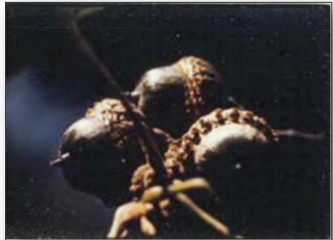
Acorns provide food for bears and many other species.

Fish There are no fishable waters on the WMA.