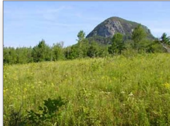
Birdseye Mountain is once again home to nesting peregrine falcons.

at a northeastern nesting site occurred in Vermont in 1970. The peregrine population was entirely wiped out in Vermont and throughout the Northeast. Their demise was due to the effects of the pesticide DDT, which thinned eggshells to the point of breaking under the weight of the parents. The peregrine falcon was listed as both a state and federal endangered species.