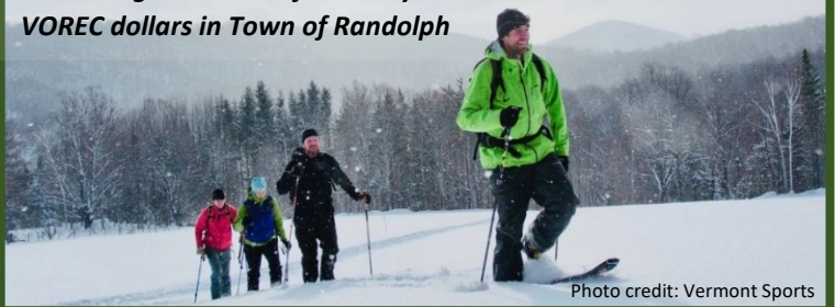
Marketing and events funded by FY19 VOREC dollars in Town of Randolph

https://fpr.vermont.gov/recreation/recreation-grants/vorec-community-grant-program