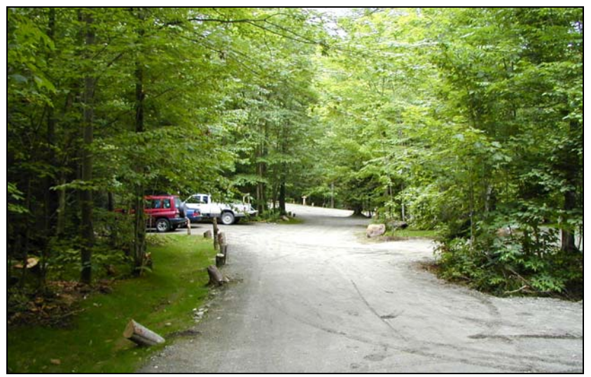
Lower Parking Area Near Boat Launch Looking West