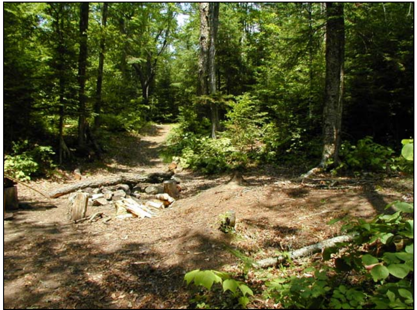
Remote Campsite #25 Prior to Site Hardening with Tent Pad

If use increases in the future, additional privies and further site hardening may be necessary to protect the vegetation and other resources at the site.