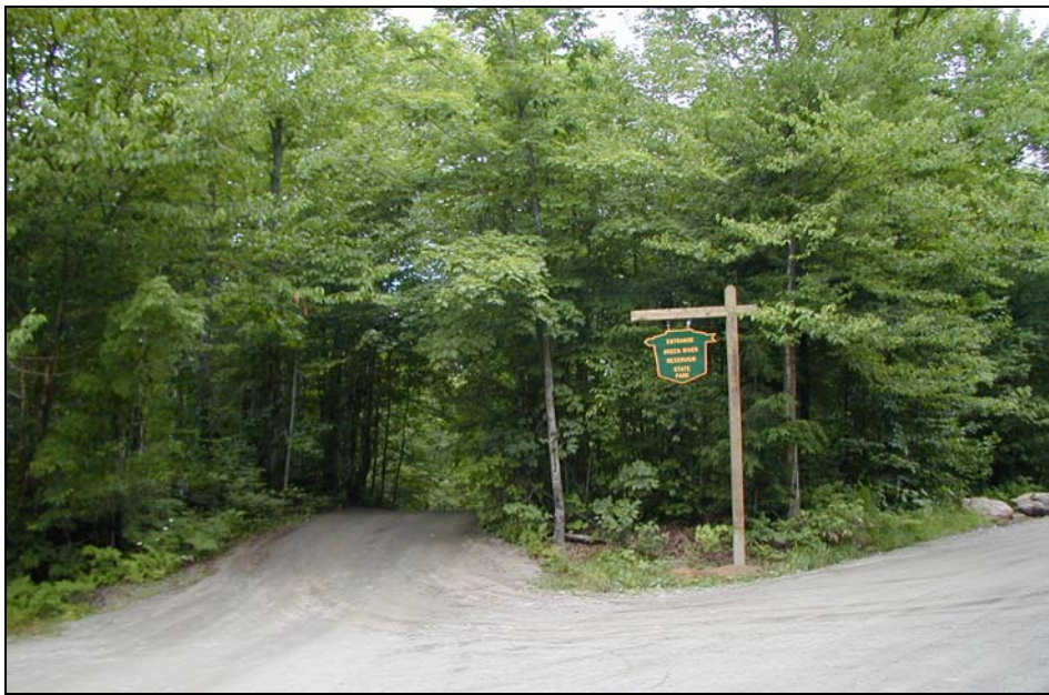
Green River Reservoir State Park Entrance