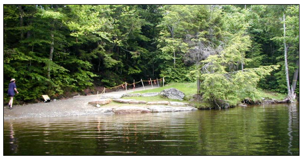
Boat Launch Area After Shoreline Stabilization Project – June 2003