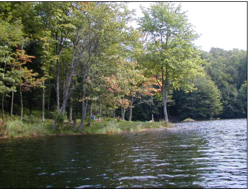
Day Use Site