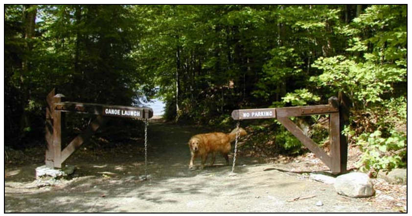
Walk-In Access to Green River Reservoir