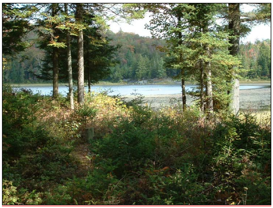
Schofield Pond Area

Near the outlet of Schofield Pond (previously named Big Pond, George Pond, and Pettingill Pond) there is still evidence of the Schofield saw mill. Early maps document a saw mill at this location at least as early as 1859. The local history describes the Schofield mill as part of a complex which included 2000 acres of timberland, farming operations which produced hay, grain and produce, a boarding house and barns. A log dam raised the pond ten feet. The mill was destroyed around 1909, but was rebuilt and powered by steam. Schofield sold his lumber to the Hyde Park Lumber Company and averaged one million board feet annually. The boarding house was used for a fishing and hunting camp as late as the 1930s. These are sensitive, regionally important historic sites and will be protected as part of the Schofield Pond complex.