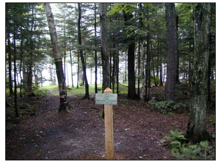
Campsite Closed for Rehabilitation