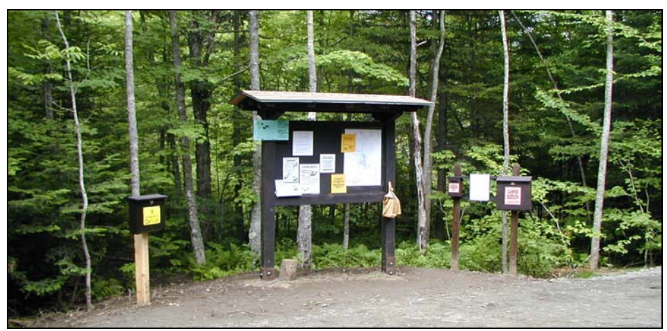
Bulletin Board Area at Boat Access