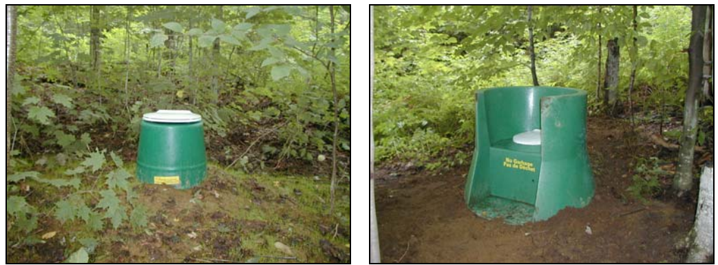
Two Types of Privies Currently Used at Individual Sites (L) and Group Site(R)

10. Install an adequate number of privies to service all campsites with signs directing users to privy location.