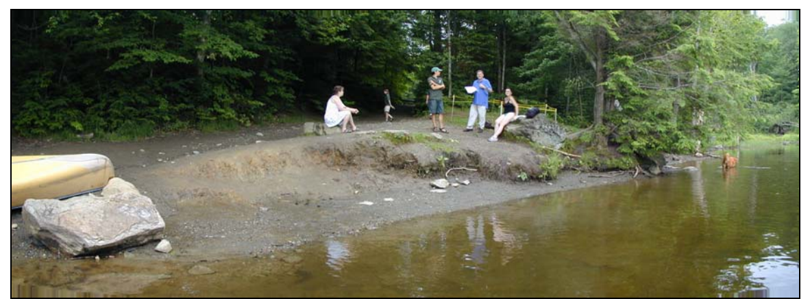
Boat Access Area Prior to Shoreline Stabilization Project – July 2000