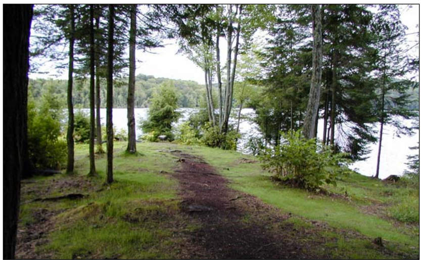
Day Use Site on Point Under Rehabilitation